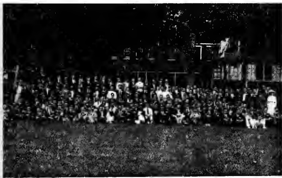
225 FOREIGN STUDENTS, REPRESENTING 28 NATIONS, AT ONE SUMMER CONFERENCE

The Associations in the universities extend genuine Christian courtesy to these visitors, open doors whereby they may come to know the Christian homes and all the best in American life, and help in any occasion of need.